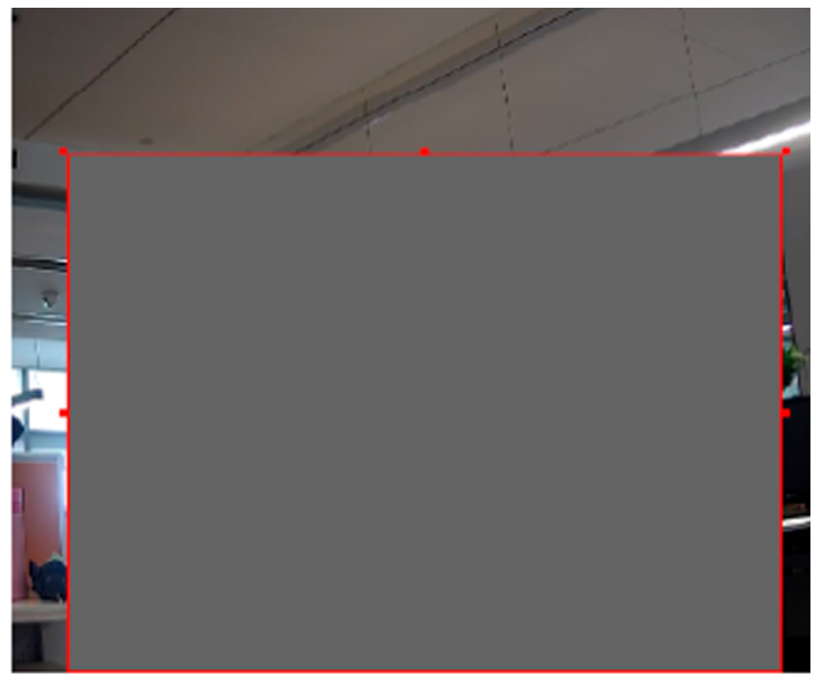
Figure 6-2 Set Video Tampering Area