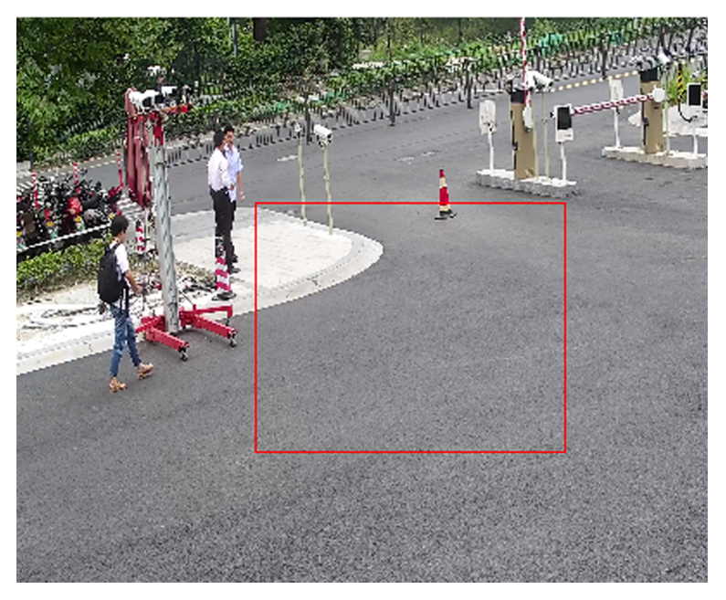
Figure 6-1 Set Rules

3. Select an Area and click imes . Click and drag the mouse on the live image and then release the mouse to finish drawing one area.